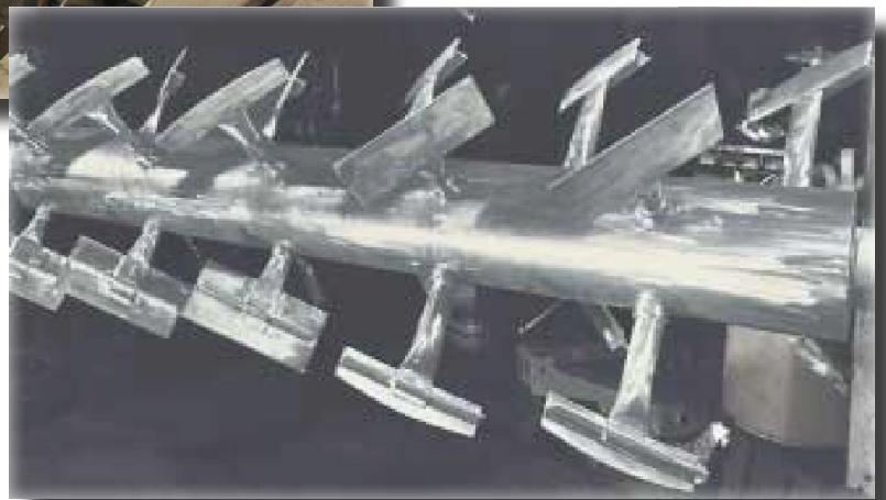
Above: A stainless steel vacuum rotary dryer for a chemical processing application.